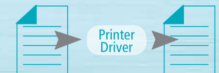
Requires more memory and time to process and print the uncompressed data